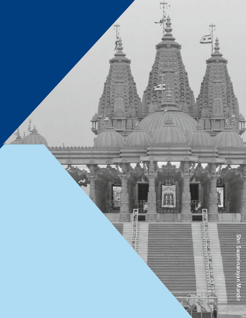
Shri Swaminarayan Mandir